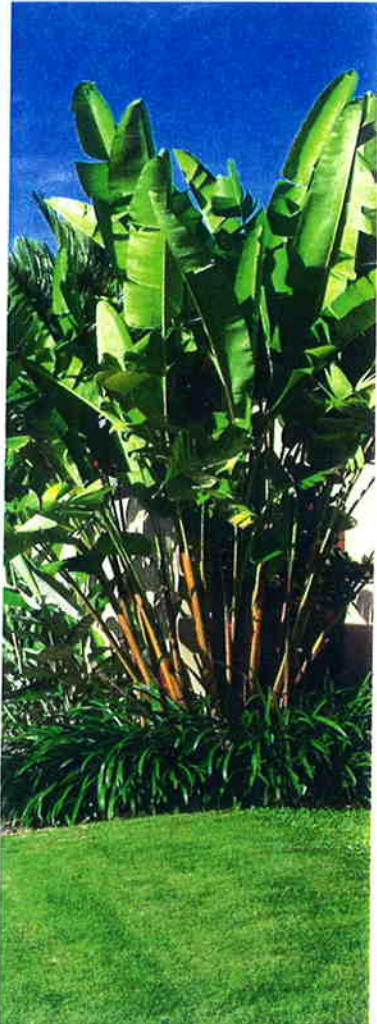
01 View from entry courtyard to the bedroom of Struthers residence, by architect Roger Mainwood.