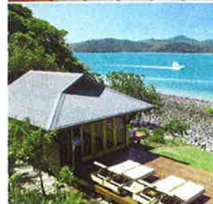
MAIN AND BOTTOM RIGHT: JOHN BRAUN