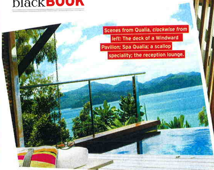
Scenes from Qualia, clockwise from left: The deck of a Windward Pavilion; Spa Qualia; a scallop speciality; the reception lounge.