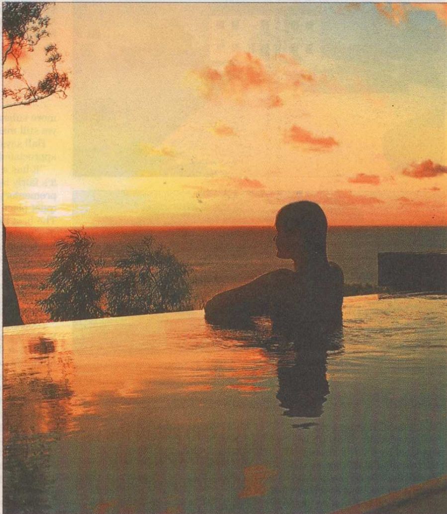
Guests can enjoy their own private swimming pool with spectacular views across the Coral Sea.